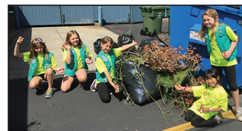
Orinda Action Day volunteers.