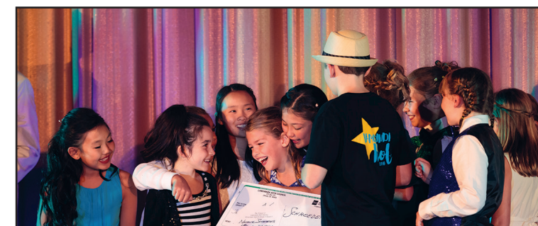
Lamorinda Idol youth singing competition.