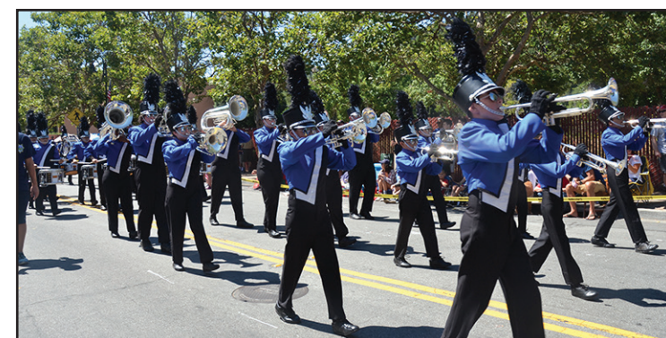
4th of July Parade & Celebration