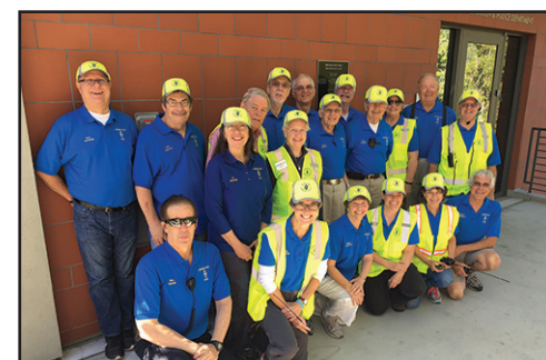
Lamorinda Emergency Radio Group.