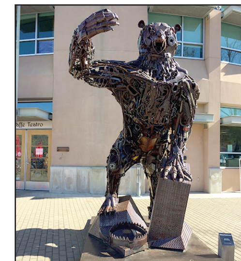
Orinda Community Foundation supports public art displays.