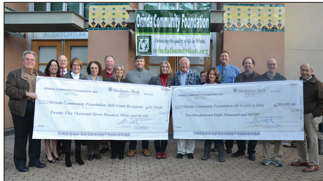
Orinda Community Foundation has donated over $208,000 for enhancing our community.