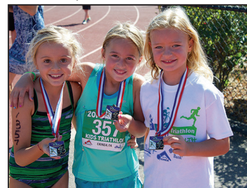
NorCal Kids Triathlon.