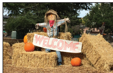
Orinda Garden Club beautification project.