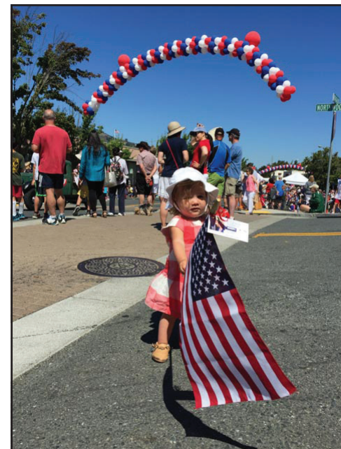
4th of July Parade & Celebration