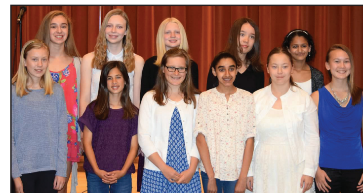
Youth Ink Writing Project