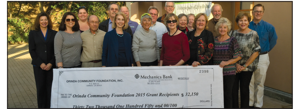
OCF Board and grant recipients attend 6th anniversary party.

A new theme this year is “Keep Orinda Beautiful!” to promote keeping Orinda beautiful throughout the year. Posters created by local K-12 students are being displayed around town to remind