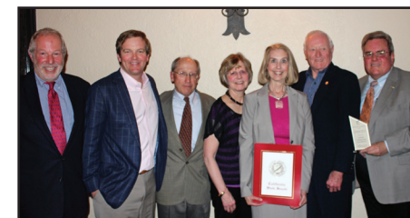
OCF Board with the William Penn Mott Jr. award.

On February 21, the OCF was honored to receive the 2015 William Penn Mott, Jr. Environmental Award from The Orinda Association. The award is named in memory of a man whose commitment to environmental preservation and education is unequalled. During his long and distinguished career, Mott led the Oakland Parks Department, the East Bay Regional