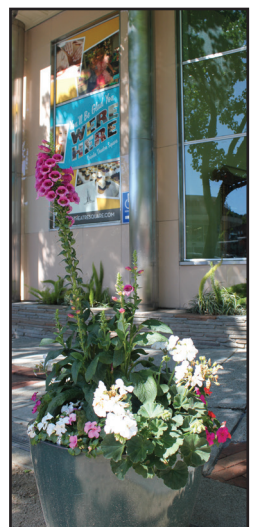
Orinda Garden Clubs beautify downtown