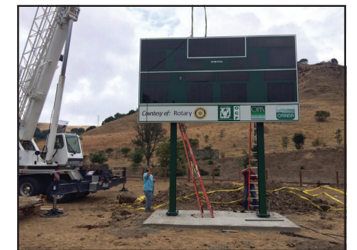
Wilder Score Board