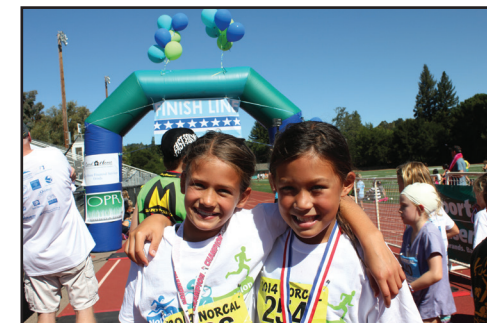
NorCal Kids Triathlon