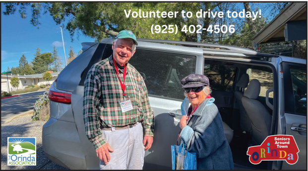
Since 2005, The Orinda Association has provided free rides to Orinda seniors via its Seniors Around Town program.