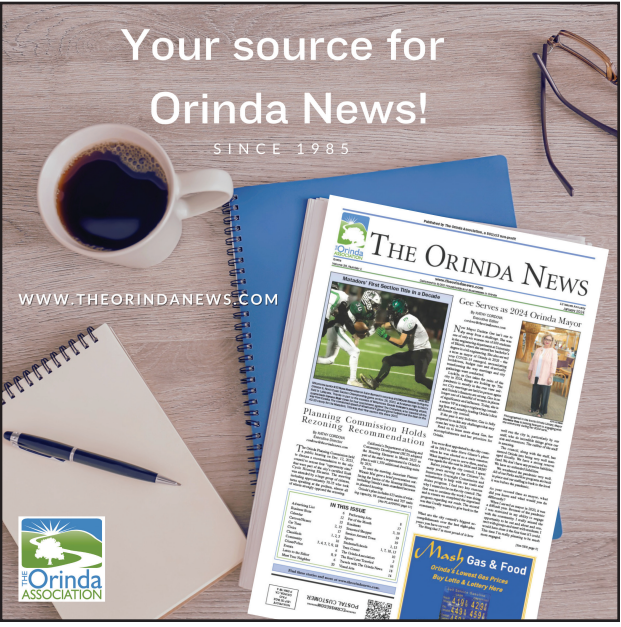
The Orinda News, published by The Orinda Association, since 1985.