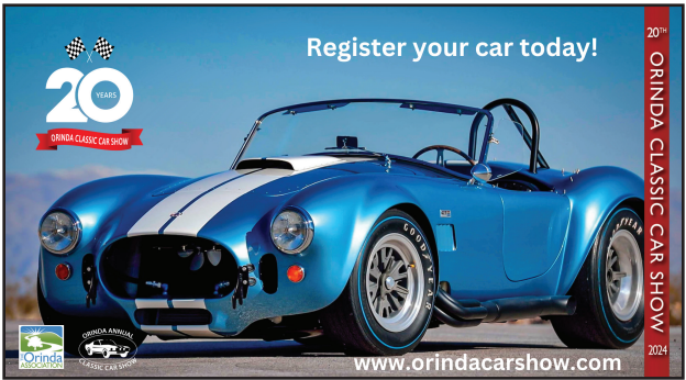
The Orinda Association presents its 20th Annual Classic Car Show in 2024.