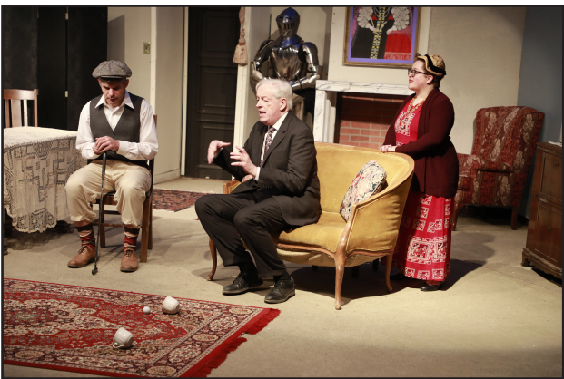
Members of the Orinda Starlight Village Players perform in Agatha Christie's The Secret of Chimneys at the Orinda Community Center Park Amphitheatre