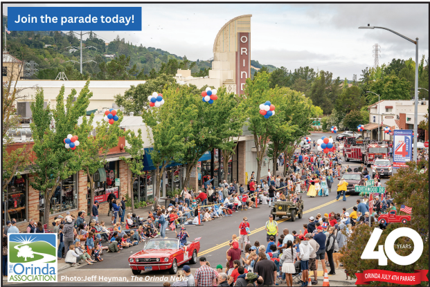
The Orinda Association presents its 40th July 4th Parade and Celebration.