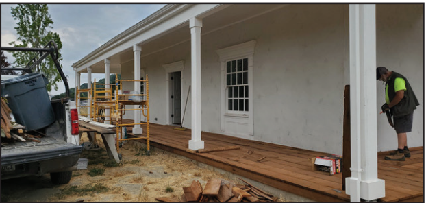
Front porch restoration at the Joaquin Moraga Adobe.