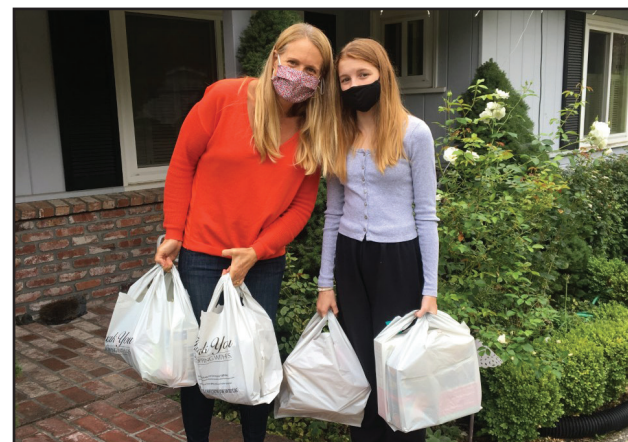
Seniors Around Town and Lamorinda Village provided senior support during covid by home delivery of groceries.