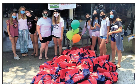
Lamorinda Village provided Emergency Go Bags to Orinda seniors.