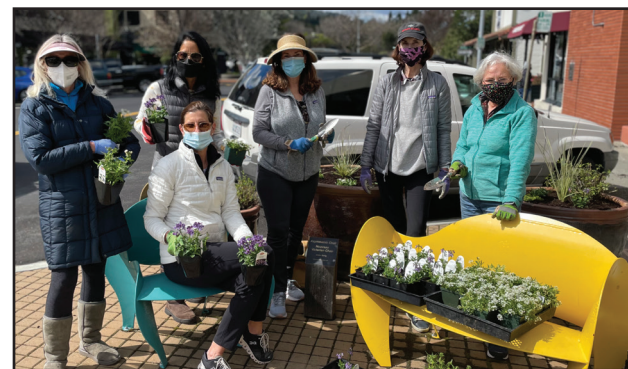
Orinda Garden Club partners with OCF for downtown beautification projects.