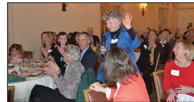
Orinda Citizen of the Year sponsored by Orinda Community Foundation.