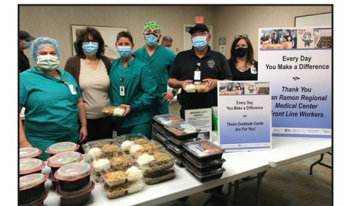
OCF supported Appreciation Lunch for Covid Front Line Workers and Orinda restaurants.