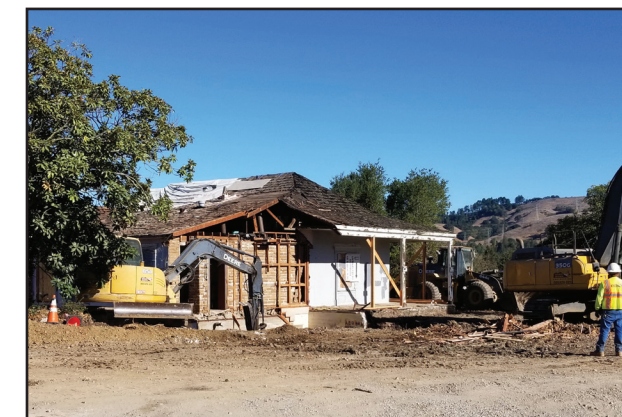
Joaquin Moraga Adobe, built 1841, being restored by Friends of JM Adobe, as a museum.