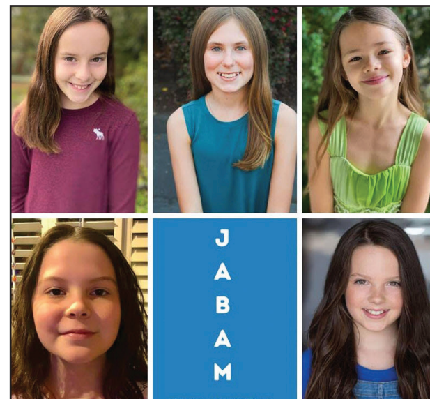
Lamorinda Idol participants.