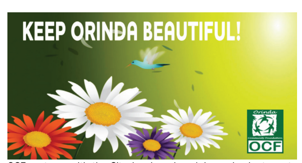
OCF partners with the City, local garden clubs and volunteers to beautify our community on annual Orinda Action Day of Community Service.