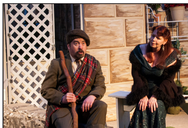
Orinda Starlight Village Players perform in the Orinda Community Center Park during the summer.