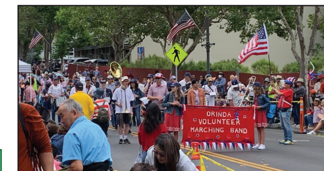
OCF partners with The Orinda Association to make 4th of July Celebration possible.