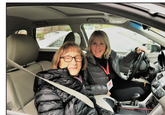
Seniors Around Town provides rides for our seniors.