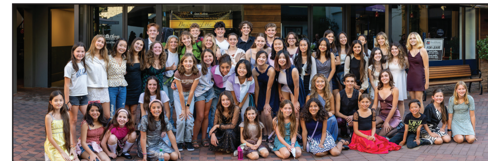
Lamorinda Idol Finalists