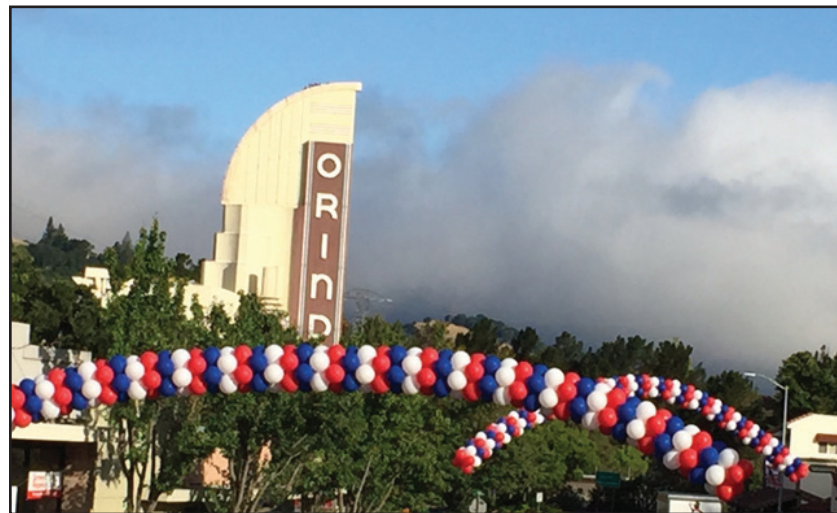
Annual 4th of July Parade & Celebration.