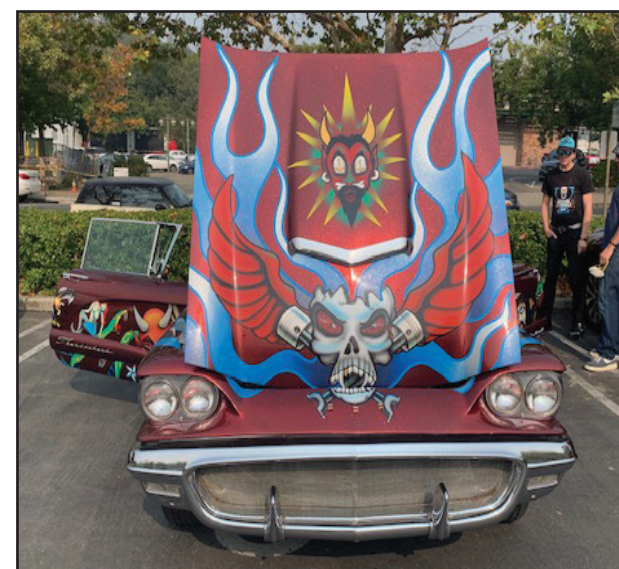
One of the many amazing vehicles to appear at the Orinda Car Show.