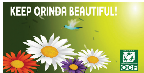
OCF sponsors Orinda Action Day of Community Service each April celebrating Earth Day.