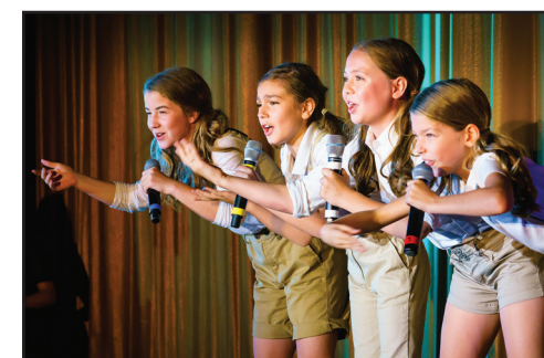
Lamorinda Idol finalists Fourte Group.