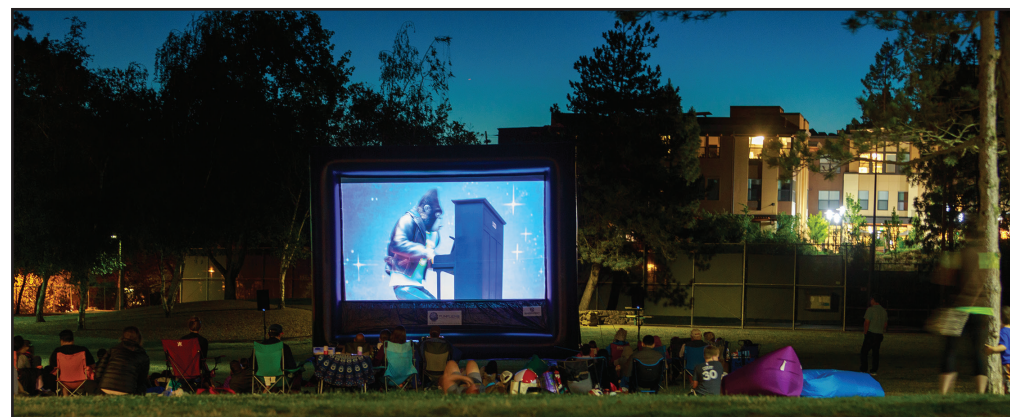
OCF sponsors Concerts in the Park & Movies in the Park.