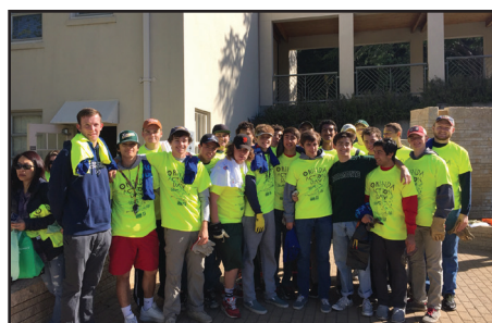
MHS LaCrosse team Orinda Action Day volunteers.