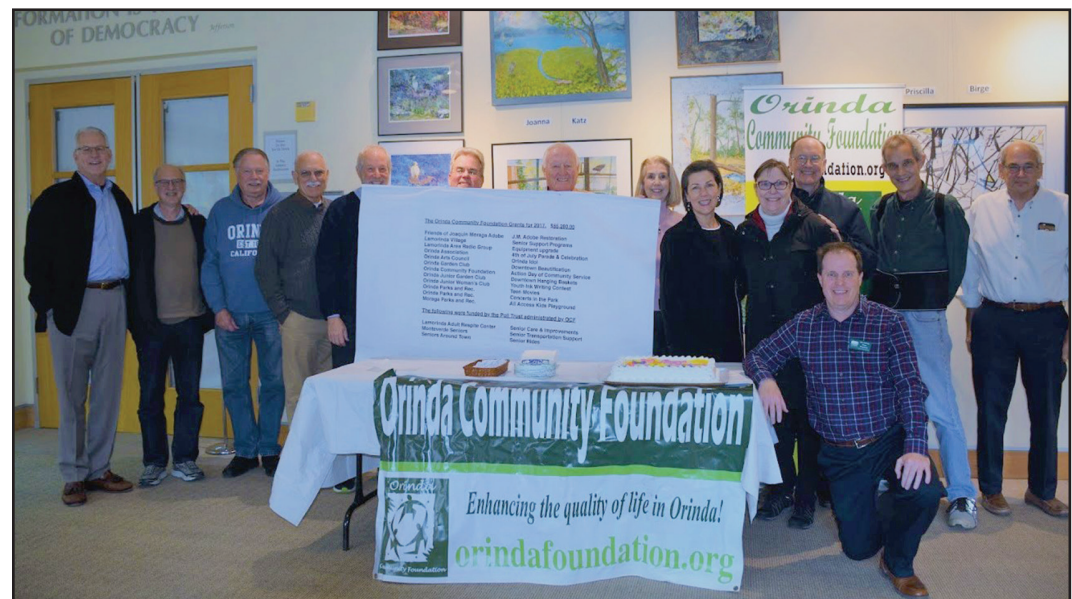
Orinda Community Foundation has donated over $250,000 for enhancing our community.