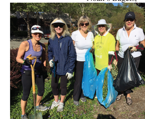
Orinda Garden Club beautifies downtown.