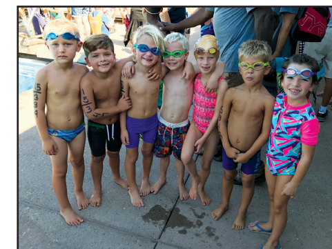
NorCal Kids Triathlon youngest participants.