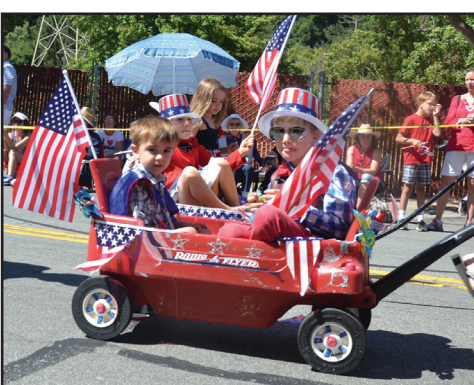
OCF partners with OA for 4th of July parade.