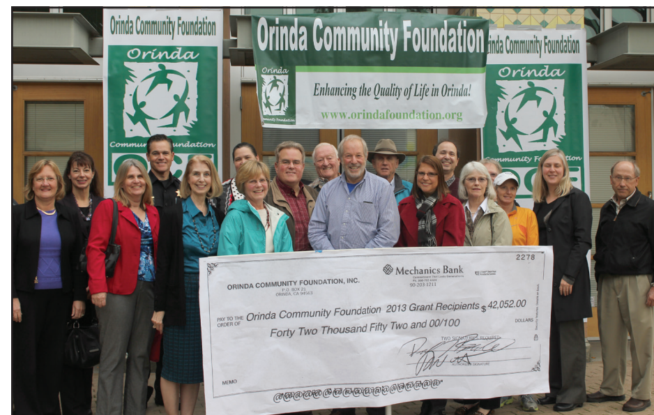
Group photo of grant recipients at the 4th OCF birthday party.