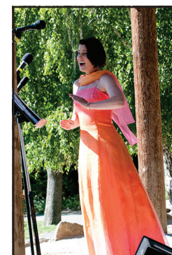
Opera in the Park