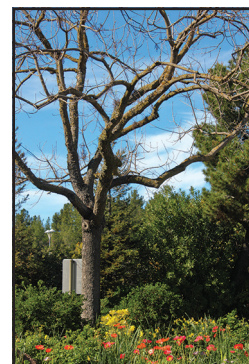
Garden Club flowers at the traffic circle near Theatre Square.