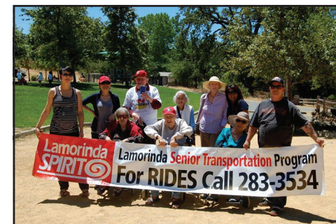
Lamorinda Spirit Van for senior rides program