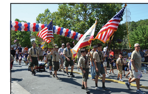
4th of July Scouts

Cozy Earth Bamboo Bedding Diablo Foods Drakes Brewing