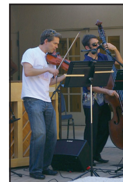
Orinda Jazz Festival