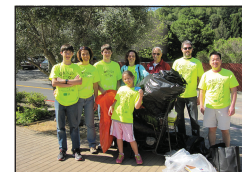
Orinda Action Day of Community Service