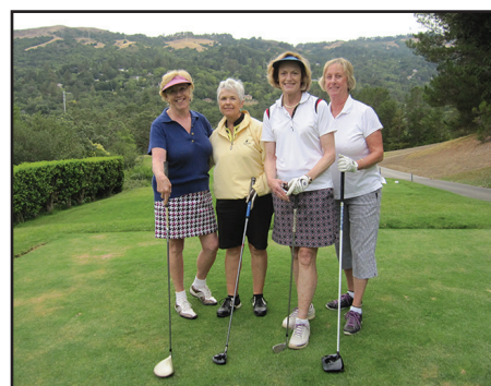
Ladies golf foursome at the Everyday Heroes fundraiser.