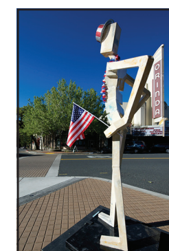
New art installed in south Orinda.